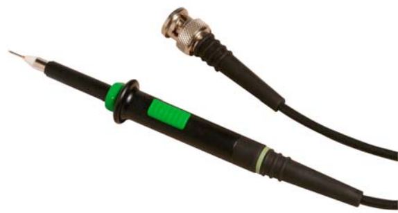
Model 6499 Modular Passive Oscilloscope Probe